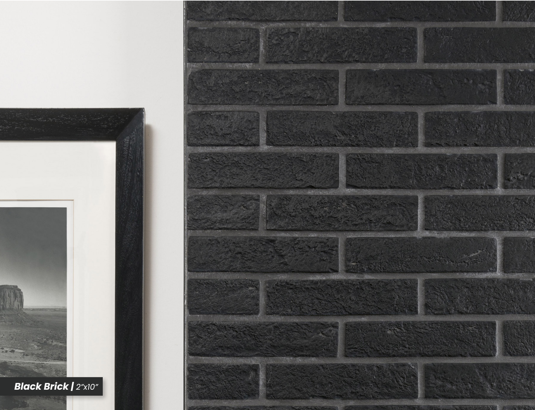
Black Brick | 2"x10"