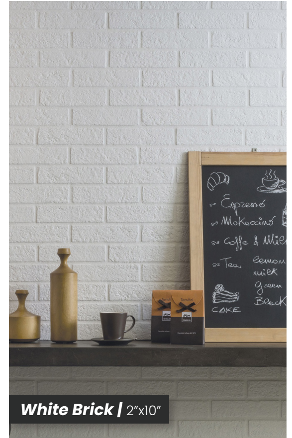
White Brick | 2"x10"