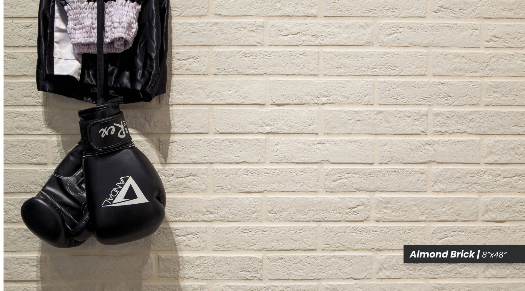
Almond Brick | 8"x48"